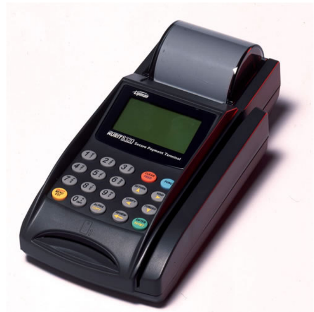
The Loyalty in a Box Lipman Nurit 8320 terminal

The schemes supported are perfect tools to develop business with increased customer loyalty and the ability to profile customer activity for active marketing campaigns. This gives truly 1-to-1 marketing capabilities.